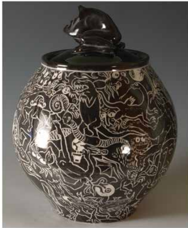
Cookie Jar with Monsters Porcelain 13.5 x 8.5"