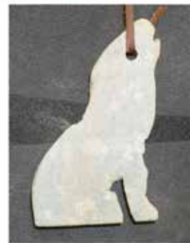
Onamia School, Onamia, MN