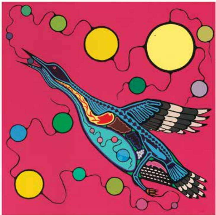
Ishpiming Meang (Loon in the Sky) Acrylic on Canvas 36 x 36"