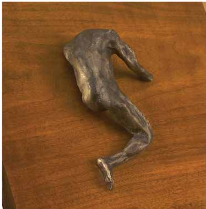
Partial Man 7 x 4" Poured Iron on Black Walnut Base 11 x 11"