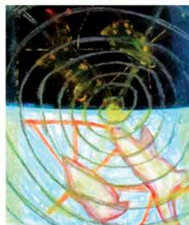
Duluth Art Institute, Duluth, MN