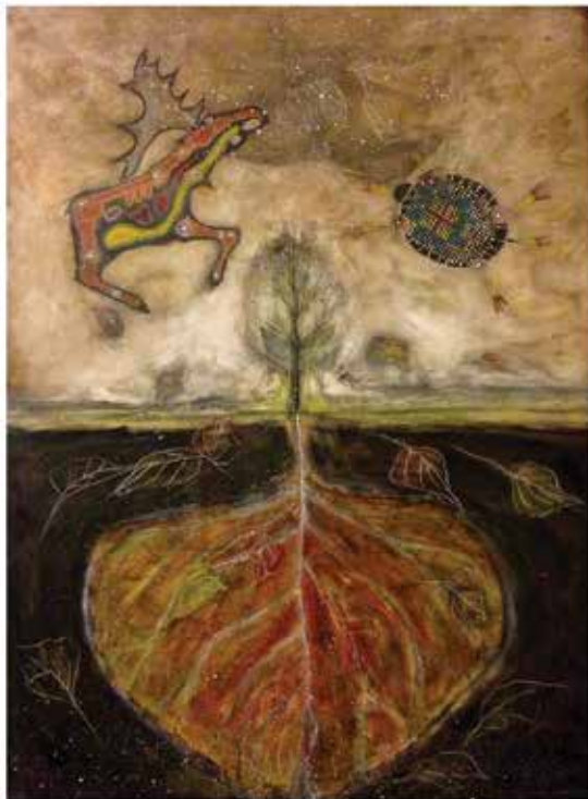
Fall Stars Mixed Media on Panel 18 x 24"